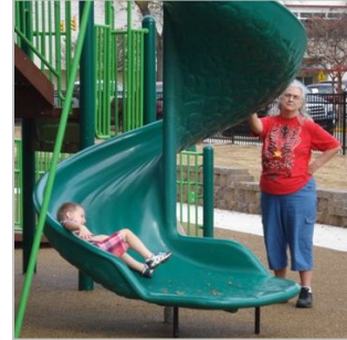
Opening day for the new playground at Zinn Park.