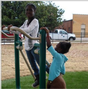
Exercise equipment for all ages gets a test run on opening day of the new park.